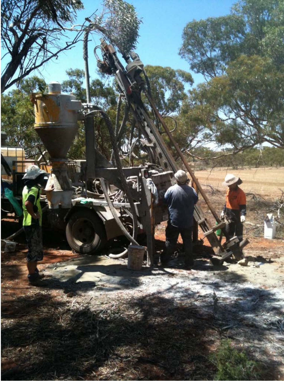
Figure 1: Drilling commencing at the Bencubbin iron ore project