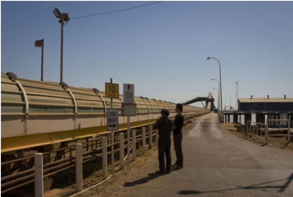
Figure 1: Anhui personnel inspecting wharf facilities at Derby Port

The Company is continuing discussions with other interested parties on its other projects as part of its diversified strategy of targeting projects with historical data and will be sending a delegation to China in later in the year with the aim to progress those discussions.